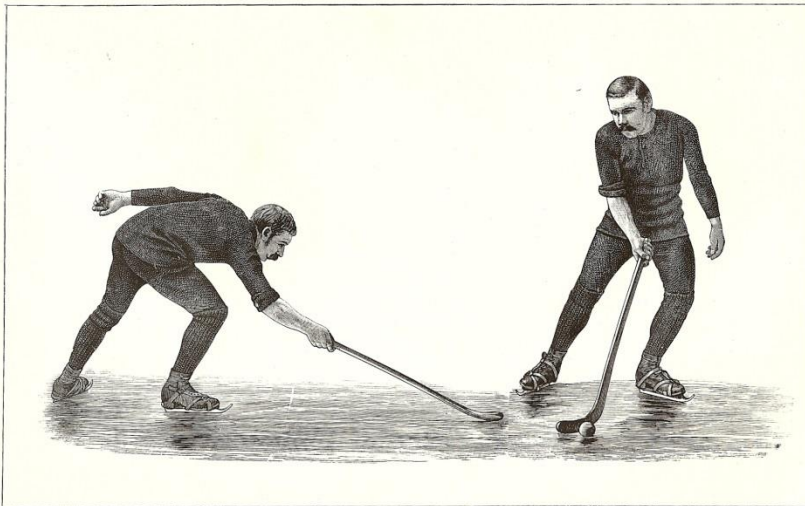
DRIBBLING AT BANDY